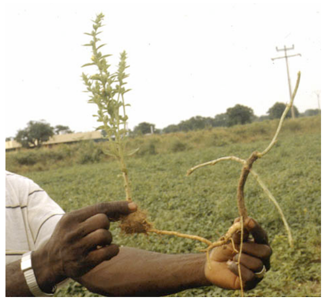
Photo 11. Alectra vogellii (Scrophulariaceae). The image perfectly shows the parasite-host union in an African zone.

Photo 10. Striga asiatica (Scrophulariaceae), a parasitic plant considered a pathogen because it causes damage to agriculture. Here it appears parasitizing maize in North Carolina (USA), where it is known as "witch weed".