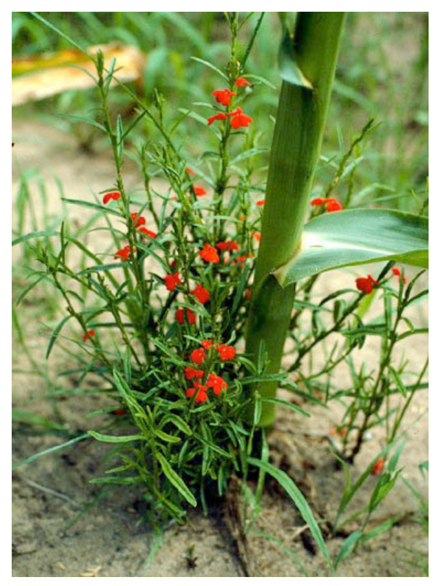
Photo 10. Striga asiatica (Scrophulariaceae), a parasitic plant considered a pathogen because it causes damage to agriculture. Here it appears parasitizing maize in North Carolina (USA), where it is known as "witch weed".