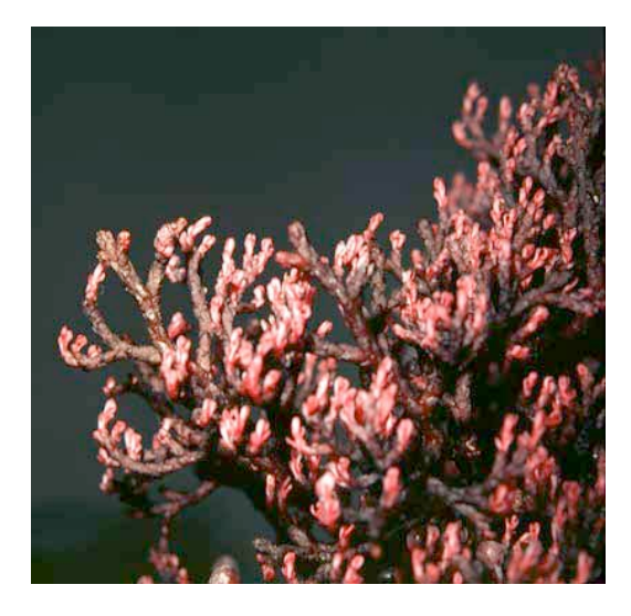
Photo 4. Parasitaxus ustus (Podocarpaceae), the only possibly parasitic gymnosperm. New Caledonia.