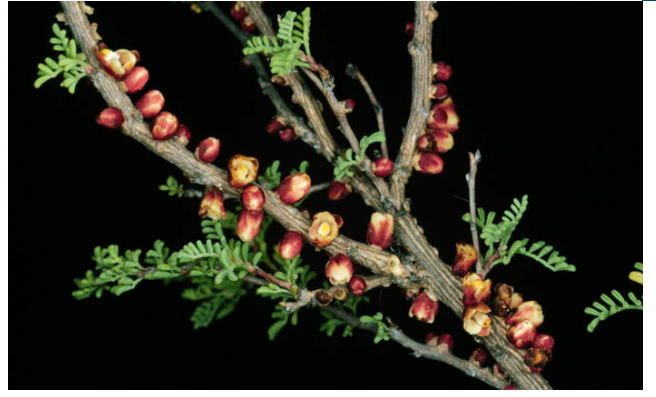
Photo 7. Pilostyles thurberi (Apodanthaceae), stem parasite of Dalea formosa , Texas (USA).

Photo 8. Macrosolen crassus (Loranthaceae). The flowers are 10 cm long and are pollinated by birds. Sarawak (Malaysia).