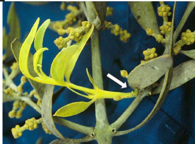
Photo 6. Phoradendron scabberinum (Viscaceae), epiparasitic on a related species, P. longifolium , in Sinaloa (Mexico).