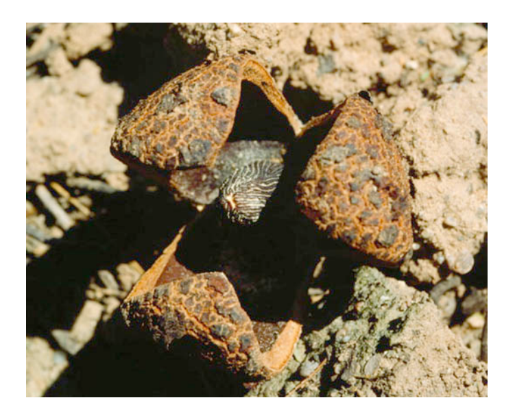
Photo 9. Prosopanche americana (Hydnoraceae). This species, parasitic on many other hosts, is on the roots of Prosopis (a tree in the legume family), belongs to a genus whose seeds are usually dispersed by possums. Argentina.