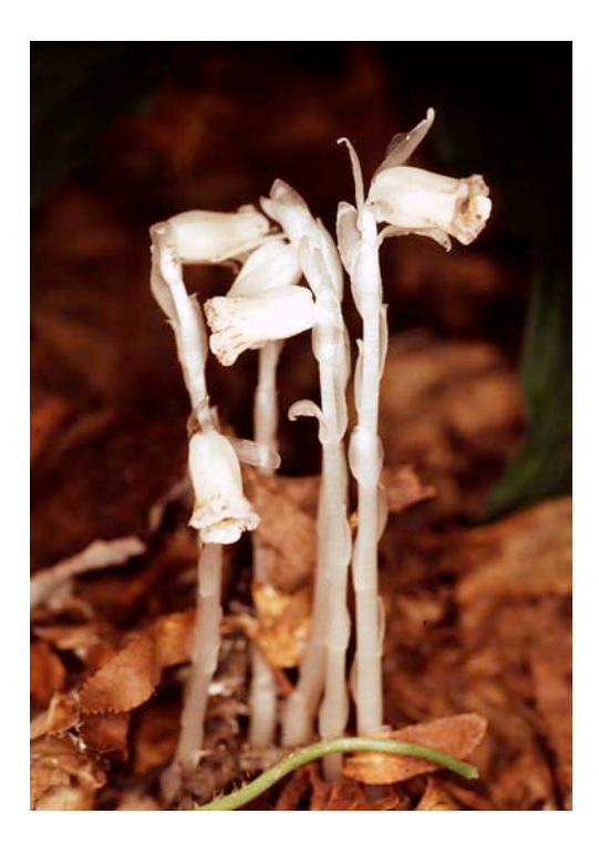
Photo 2. Monotropa uniflora , a mycotrophic species that frequently has been incorrectly considered a parasitic plant because of its ghostly appearance. North Carolina (USA).

Photo 3. Hyobanche sanguinea (Scrophulariaceae). This south African parasitic plant is one of the few that form secondary haustoria from scale leaves.