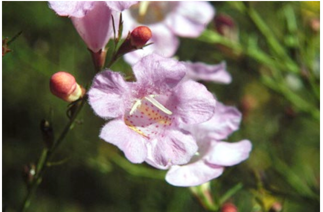
Photo 5. Agalinis purpurea (Scrophulariaceae): a facultative hemiparasite of the eastern USA.

Photo 6. Phoradendron scabberinum (Viscaceae), epiparasitic on a related species, P. longifolium , in Sinaloa (Mexico).