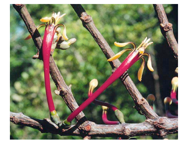
Photo 8. Macrosolen crassus (Loranthaceae). The flowers are 10 cm long and are pollinated by birds. Sarawak (Malaysia).

Photo 7. Pilostyles thurberi (Apodanthaceae), stem parasite of Dalea formosa , Texas (USA).