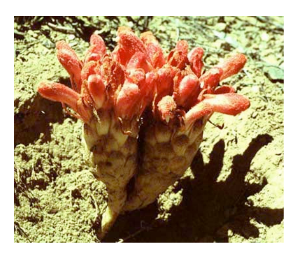
Photo 3. Hyobanche sanguinea (Scrophulariaceae). This south African parasitic plant is one of the few that form secondary haustoria from scale leaves.

Photo 2. Monotropa uniflora , a mycotrophic species that frequently has been incorrectly considered a parasitic plant because of its ghostly appearance. North Carolina (USA).