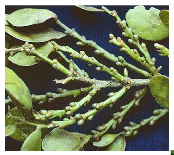
Photo 22. Antidaphne viscoidea (Santalaceae). This mistletoe, shown in this photograph with developing fruits, has also been classified in Eremolepidaceae, Monteverde (Costa Rica).

Photo 23. Viscum minutissimum (Viscaceae), a peculiar mistletoe parasitic on Euphorbia polygona , near Riebeek Oos, South Africa. The aerial part of the plant is only 3 mm of of length.