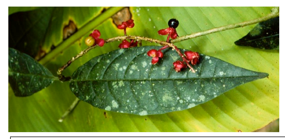
Photo 16. Heisteria acuminata (Olacaceae). The bright red calyx of this tree species expands as the fruit develops, La Selva (Costa Rica).