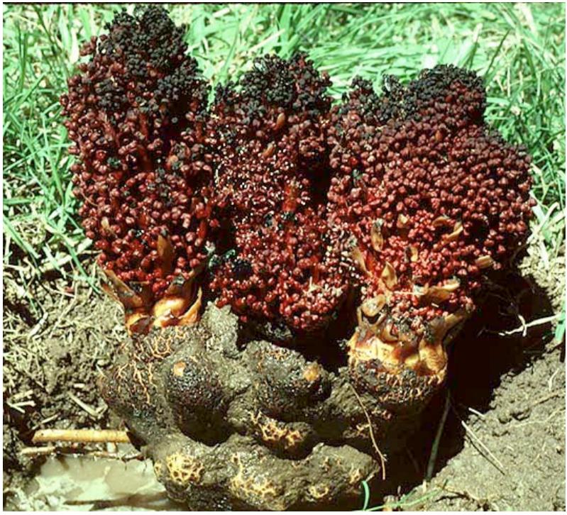
Photo 29. Corynaea crassa (Balanophoraceae), young inflorescences and haustorial connection to the host root. Costa Rica.

Photo 30. Sarcophyte sanguinea (Balanophoraceae) has a tuberous and massive haustorium that here is attacking the roots of the host, Riebeek Oos, South Africa.