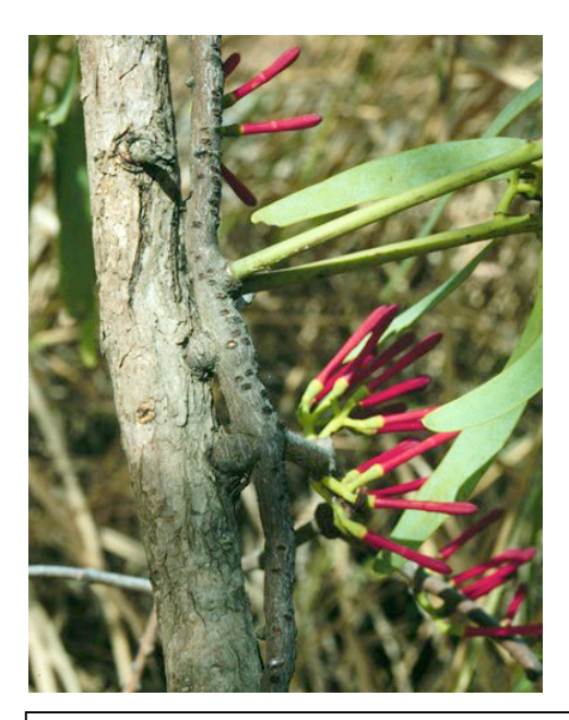
Photo 20. Amyema sanguineum (Loranthaceae) parasitic on Eucalyptus , Queensland (Australia).