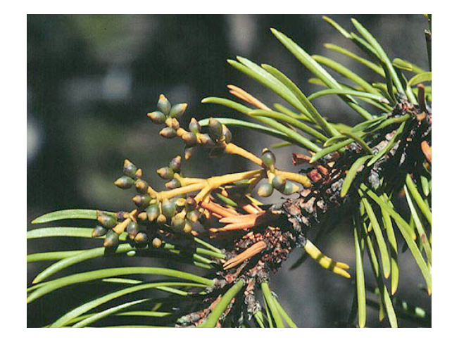
Foto 25. Arceuthobium americanum (Viscaceae), Saguache (Colorado, USA).

Photo 24. Korthalsella latissima (Viscaceae). This parasite of Acacia koa has phylloclades with numerous minute flowers at the nodes, Hawai'i, Hawai'i.