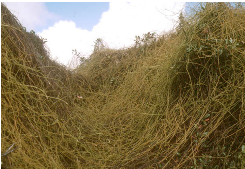
Photo 13. Cassytha is the only parasitic genus in Lauraceae, morphologically very similar to the species of Cuscuta (Convolvulaceae)

Photo 12. The parasitic pantropical Cassytha filiformis (Lauraceae) often seems to behave in a totally indiscriminate fashion in the selection of its host, covering and simultaneously parasitizing dozens of host species. Moreover, this parasite forms, with equal frequency, unions with itself (autoparasitism) and its host. Here it appears parasitizing a tree in Zimbabwe.