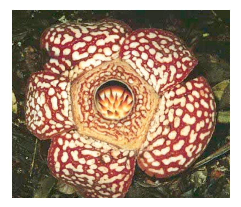
Photo 31: Rafflesia pricei (Rafflesiaceae), parasitic on Tetrastigma (Vitaceae). Sabah (Borneo, Malaysia).

Photo 30. Sarcophyte sanguinea (Balanophoraceae) has a tuberous and massive haustorium that here is attacking the roots of the host, Riebeek Oos, South Africa.