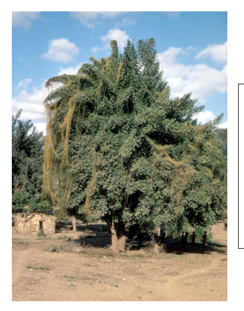
Photo 12. The parasitic pantropical Cassytha filiformis (Lauraceae) often seems to behave in a totally indiscriminate fashion in the selection of its host, covering and simultaneously parasitizing dozens of host species. Moreover, this parasite forms, with equal frequency, unions with itself (autoparasitism) and its host. Here it appears parasitizing a tree in Zimbabwe.