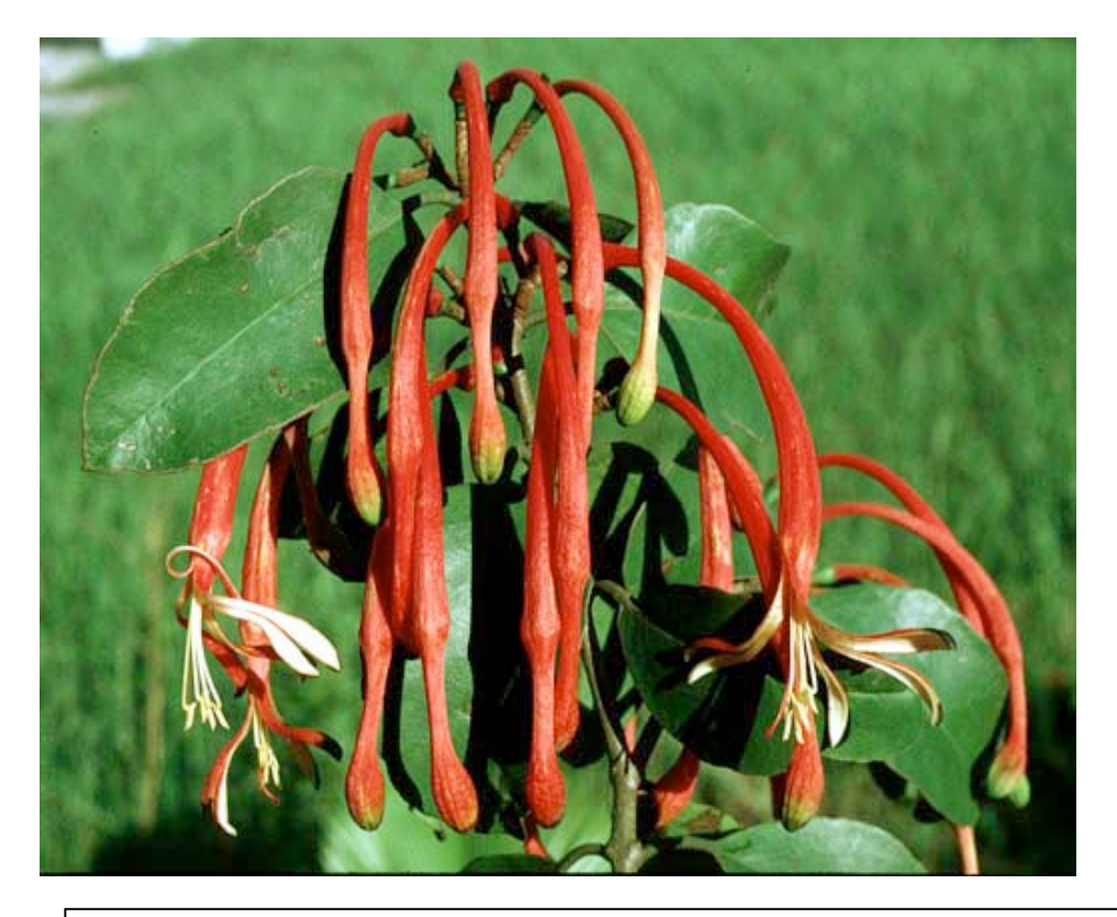
Photo 17. Loxanthera speciosa (Loranthaceae). This monotypic mistletoe has flowers ca. 12 cm in length, Sarawak (Malaysia).