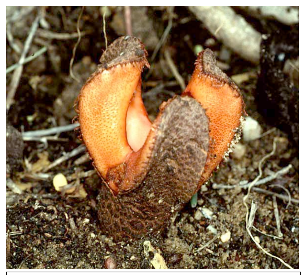
Photo 14. Hydnora africana (Hydnoraceae), whose only flower emerges from the roots of Euphorbia , is "the strangest plant of the world" according to some investigators, Worcester (South Africa).