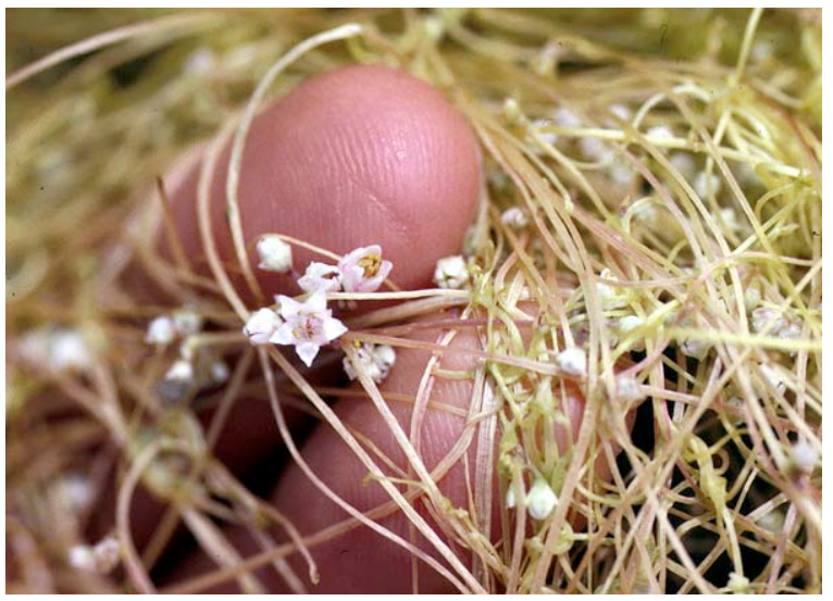
Photo 27. Cuscuta babylonica (Convolvulaceae) in flower, Palestine.

Photo 26. Krameria lanceolata (Krameriaceae), Texas (USA).