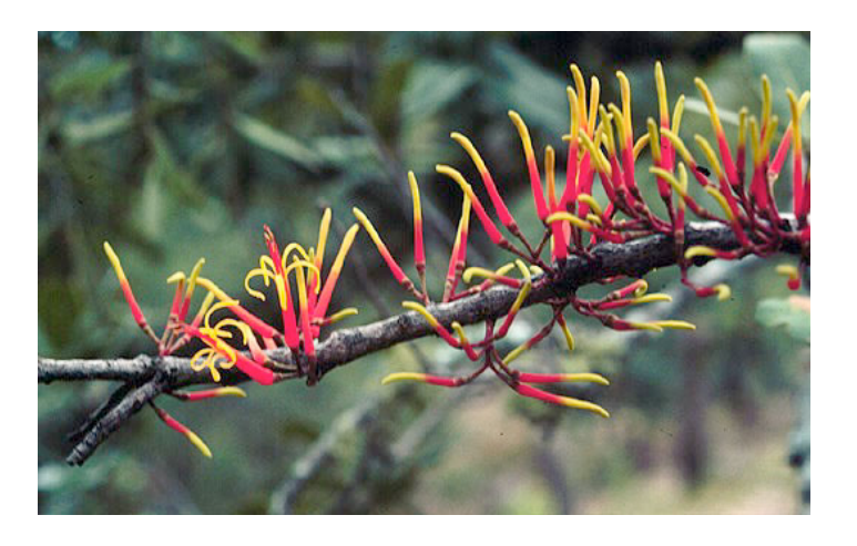
Photo 19. Agonandra macrocarpa (Opiliaceae). This large tree, shown here with male flowers, is surprisingly a parasitic plant. Parque Nacional de Santa Rosa (Costa Rica).

Photo 18. Psittacanthus ramiflorus (Loranthaceae), a parasite of Quercus spp. in