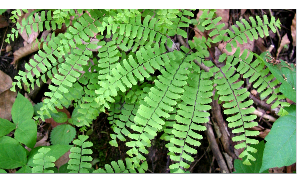
ABOVE maidenhair fern (Adiantum pedatum). © Connie Carroll-Cunningham. RIGHT American bellflower (Campanula americana). © Connie Carroll-Cunningham.

Illinois Plants provides a great variety of information. It includes native plants, invasives, and the ornamentals that occasionally escape into the wild. The site includes detailed information about plant taxonomy, plant traits (such as flowers, leaf arrangement, and basic physiology), flowering dates, and distributions. We have great photos for many of the species and are constantly acquiring more; there is even a way for users to submit their own images to be incorporated